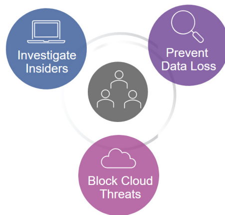
Figure 1: One Console, One Agent, One Cloud-native platform, with common alert management and investigations, policy uniformity, privacy controls, reporting and analytics.

Our platform lets you enforce stricter controls for high-risk users. These users can be highly targeted or vulnerable. They can also be members of privileged groups, such as admins and VIPs.